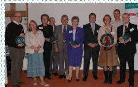
2006 Awards winners with Ed Vaisey MP (4 th from right)