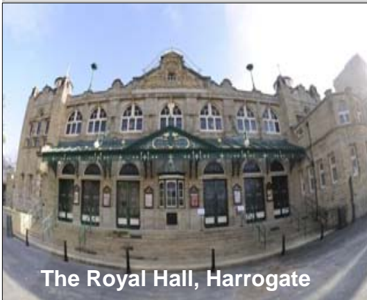
The Royal Hall, Harrogate